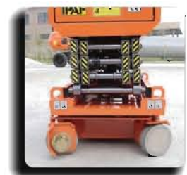
Compact Turning Radius