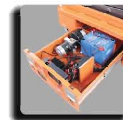
Slide Out Tray