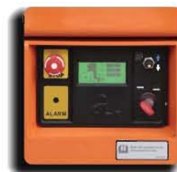
Touch Display Screen